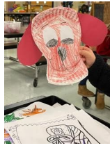
CLIFFORD THE BIG RED DOG!

Our first color RED "Y" Set Go! Long Day was a huge success!