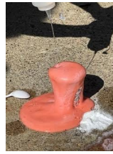
EXPLODING RED VOLCANOS