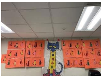
Pete the Cat