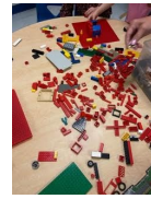
RED LEGO Challenge